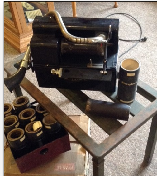
This Dictaphone was the 20th century predecessor to today's digital hand-held voice recorder.