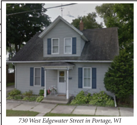
730 West Edgewater Street in Portage, WI